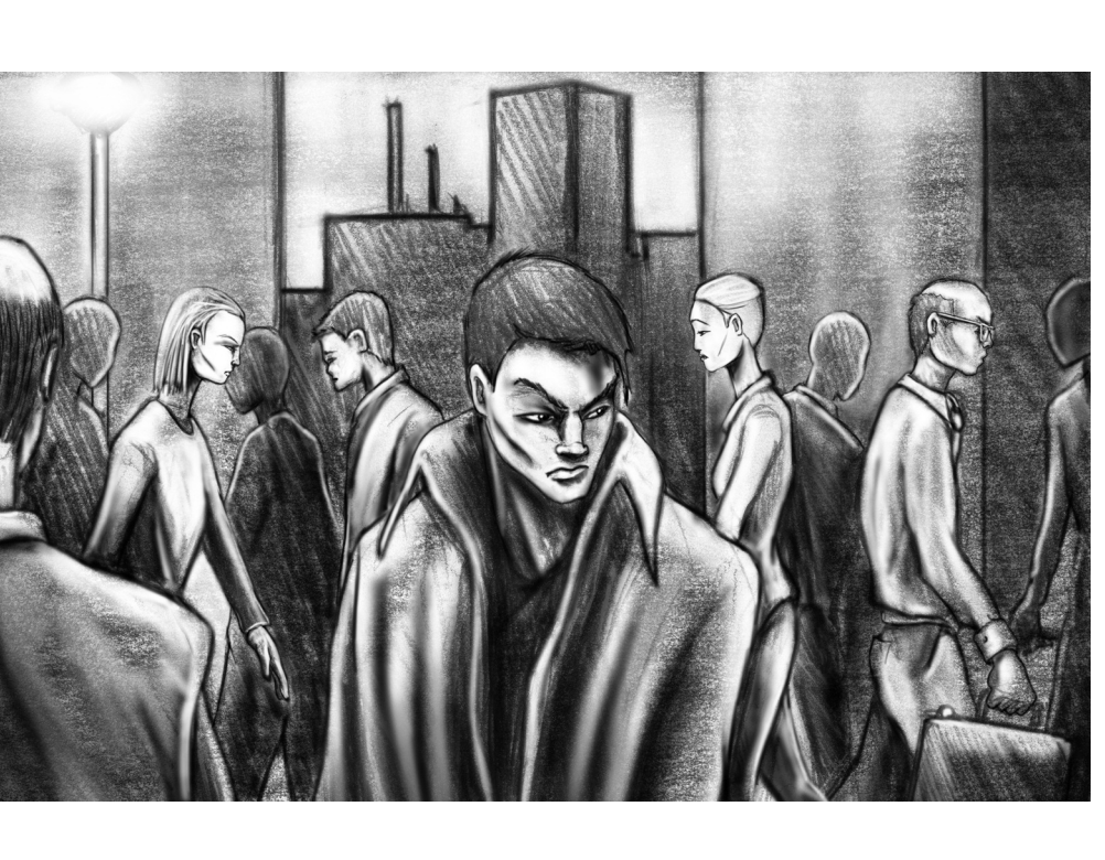
The Dark Man walks the busy streets.