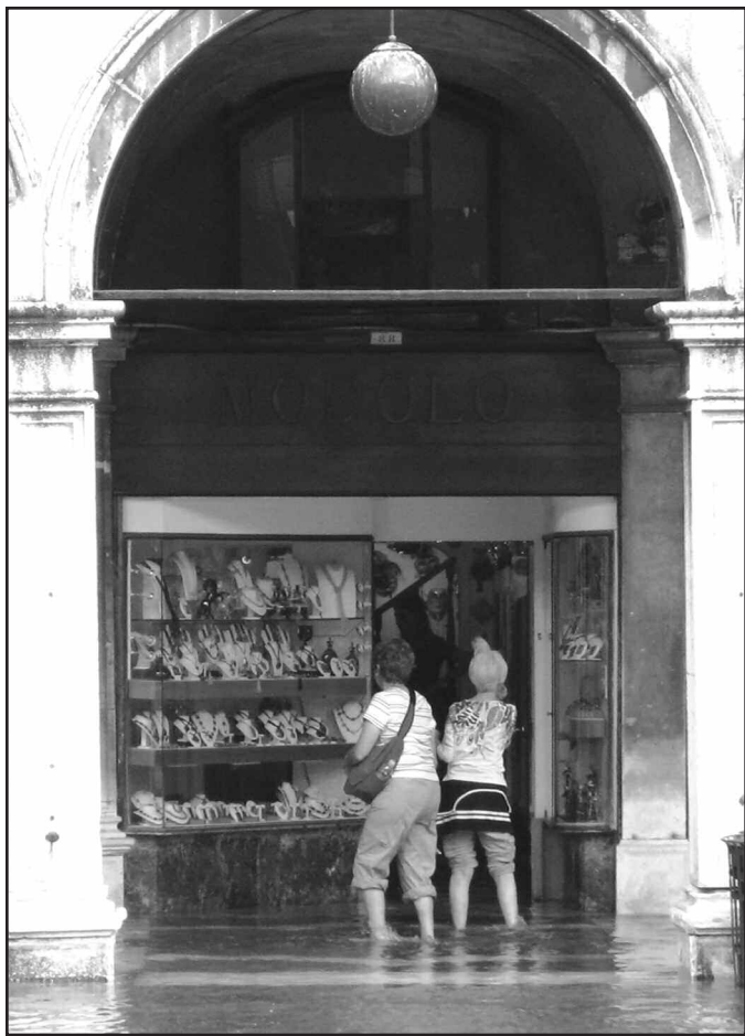
When the tide gets high, the streets flood with a few inches of water.